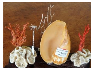
From left: Hot food holder ($28) Helen Stewart, key holder ($25) Rosallina