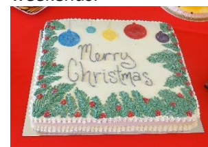
Our Christmas cake!

We're open 10-3 Monday to Friday and 10-1 weekends.